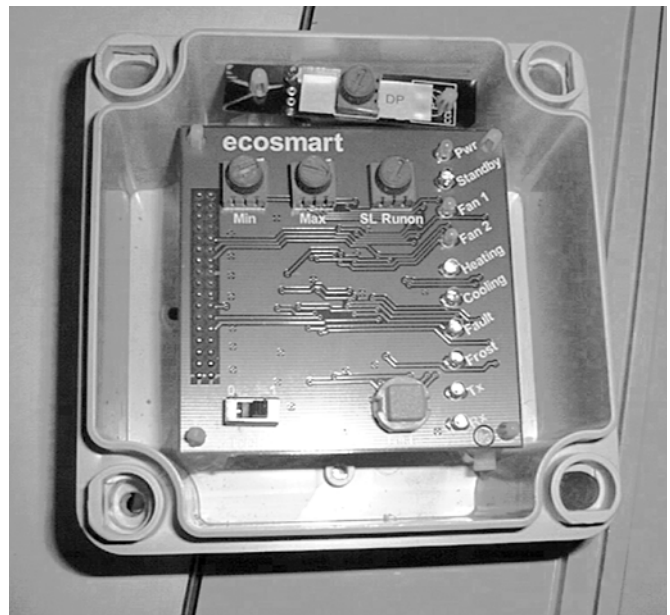
Figure 5. Fan side commissioning box.